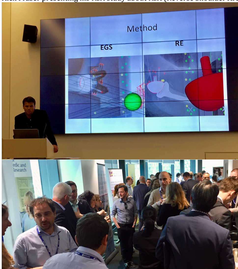
Informal discussions during the poster presentations. The RSA community growing together!