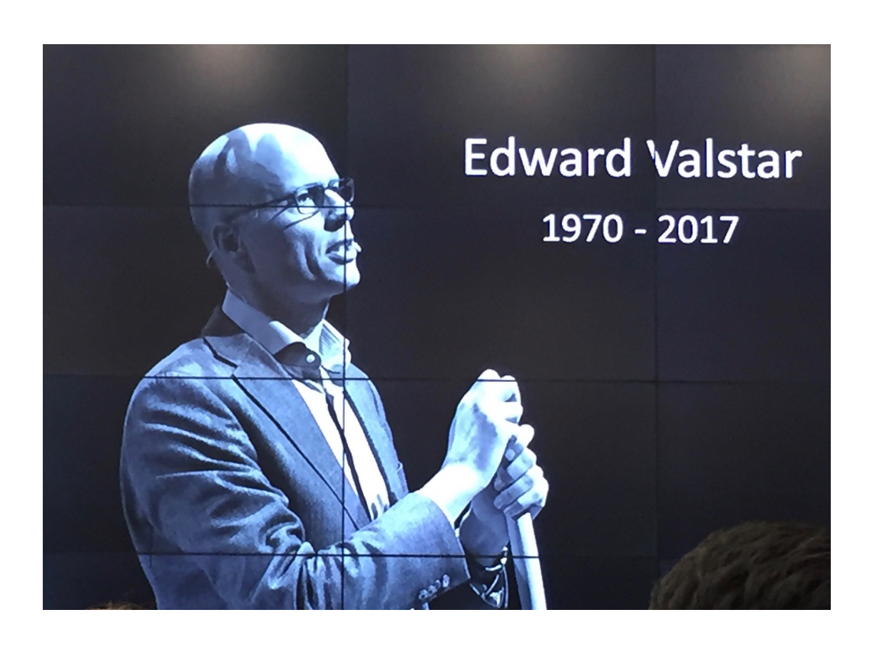
The RSA community has lost a great visioner! We will miss your spirit – R.I.P.!